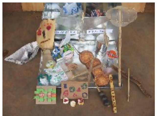
Art and Music Box