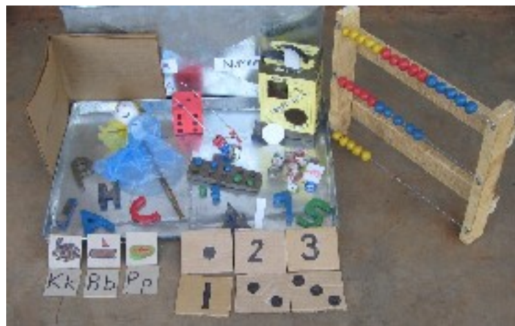
Number and Alphabet Box