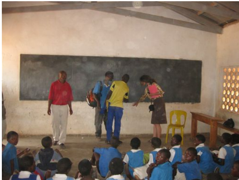
Assessing the state of the walls before decoration works start is realized in cooperation with the school management, painters and boNGO directors.