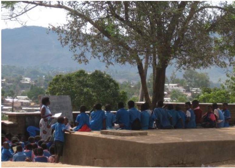
Some classrooms can't benefit from the project at all as they don't have any walls. (Mbayani Primary school in the city of Blantyre)