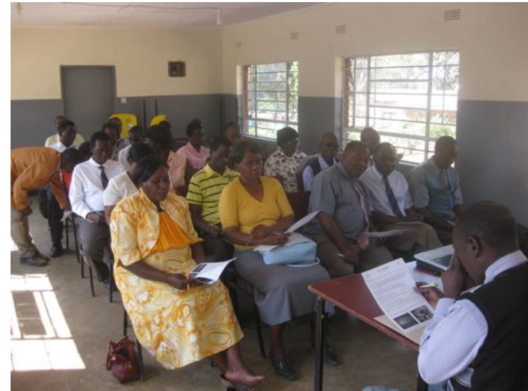
Before the project is brought to a new area of Blantyre, a meeting between boNGO and all the local school head-masters takes place. There the conditions of the project are discussed as well as involvement of the Parent Committees.