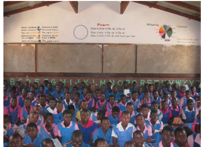
Each decorated classroom contributes to better education of more than 1000 children.